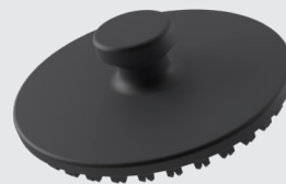
MM-Welding® one component clip solution.