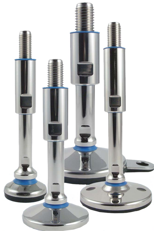
Products from the hygiene range

Depending on their design and equipment, levelling feet can be used to reduce vibrations and shocks, which extends the service life of machines and equipment. Optional rubber soles provide additional stability and reduce the risk of unintentional slipping or shifting. Noise can also be reduced in this way.